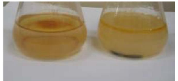
Figure 5b. Non-illuminated view of culture flask