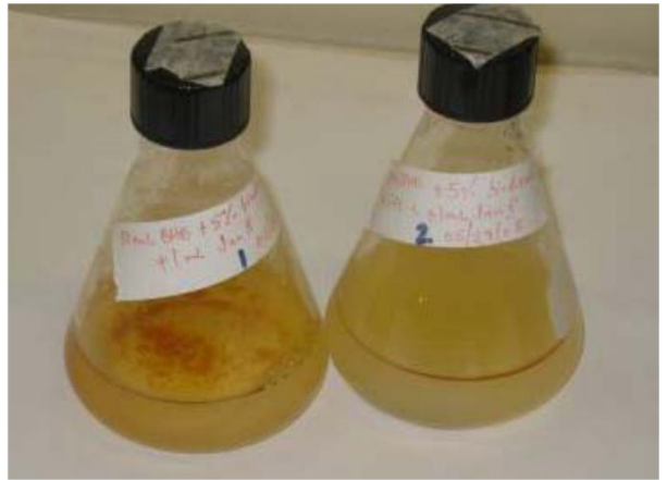
Figure 4. Culture flasks after shaking