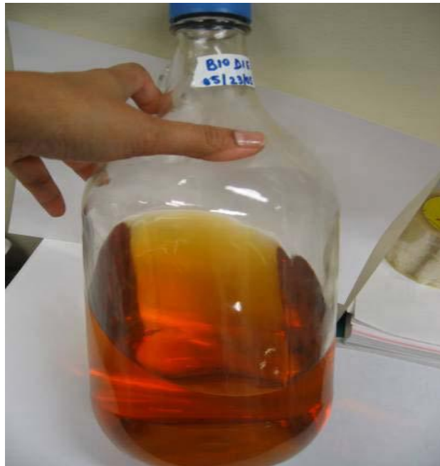
Figure 1. Biodiesel B20 after treatment by on line catalyst system

The contaminated biodiesel in the In Line circulation system that included the In Line Catalyst, showed marked differences as evident in the absorbance of UV-Visible spectroscopy. A fresh biodiesel blend was used as the blank for this analysis. The appearance of a peak in the UV-Visible spectrum from the inoculated biodiesel blend shows that the bacteria produce measurable differences in the composition of the biodiesel blend compared to the uninfected biodiesel blank. In addition differences in visual color were also evident (Figure 1). Suspended particulate matter was evident in the infected biodiesel blend. These particulates settled at the bottom of the glass jar. The same particulates were not evident after exposure to the In Line Catalyst.