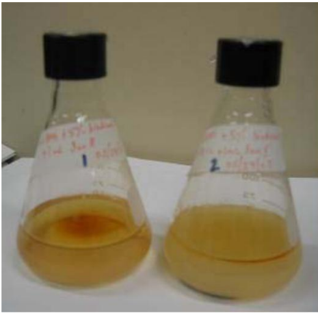
Figure 3. Appearance of culture flasks